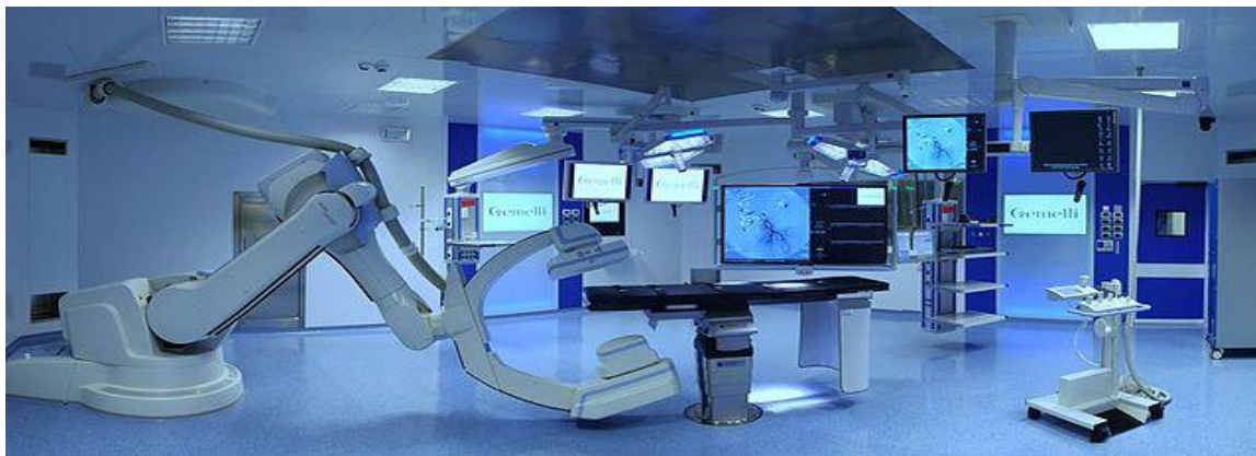
Hybrid OR for Cardiovascular surgery at Gemelli Hospital in Rome.

Hybrid operation rooms are the combination of advanced imaging laboratories (i.e., fixed C-Arms, Computerized Tomography, MR Scanner) and the Surgical Theatres. These Imaging devices disable the long duration of surgery and Enables minimally invasive procedures which are less traumatic to the patient. Here, the scenario of the surgery is completely changed. Surgeon doesn't need to cut open the patient body to access the diseased part but he/she uses certain tools to access, like Catheters or Endoscopes through key holes. These newer procedures require imaging techniques that can able to visualize very smaller anatomical parts like thinner vessels in heart and heart muscle and this can be achieved through INTRA-OPERATIVE 3D IMAGING.